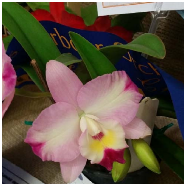
Champion Laeliinae – B&J Lennon Slc. Maris Beat "Lipstick"