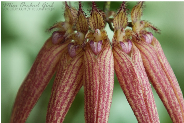
Bulbophyllum Elizabeth Ann "Buckleberry"