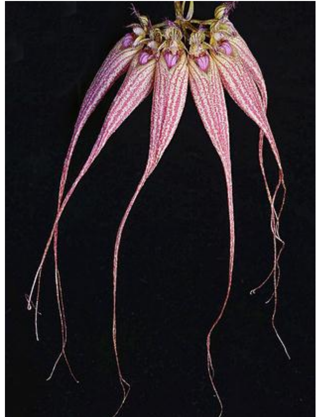
Bulbophyllum Elizabeth Ann 'Buckleberry'