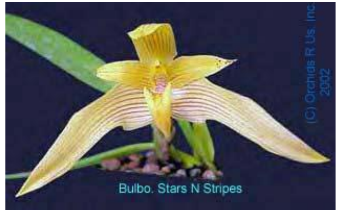
Bulbophyllum Stars and Stripes

There are many excellent growers represented here. Sadly a couple have passed away and a couple have moved away, but most are still growing beautiful orchids and exhibiting them at our shows.