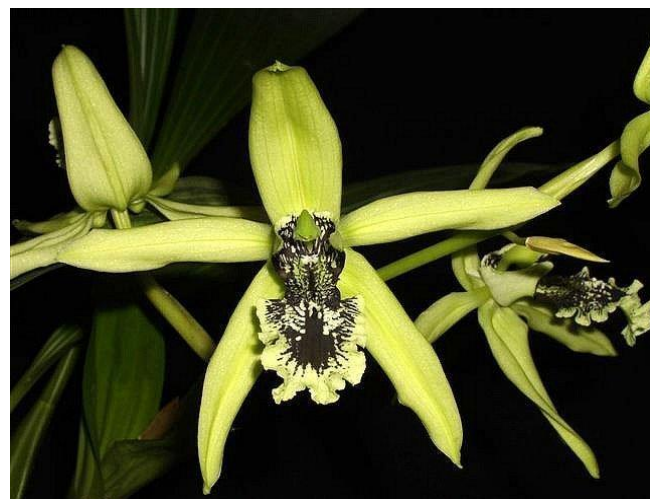
Here is Coelogyne pandurata – note the lip does not have orange markings.