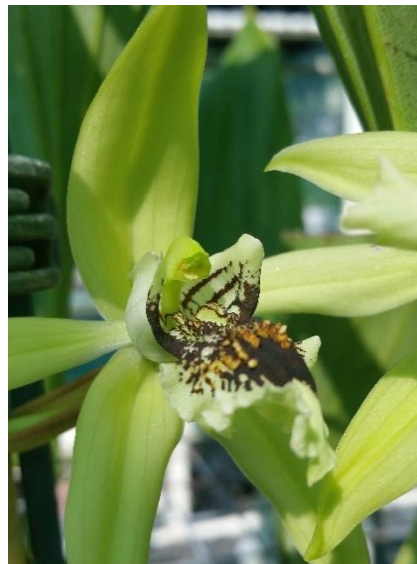
This is my plant and the orange markings on the lip probably identify it as Coelogyne Burfordiense with the markings coming from Coelogyne asperata .