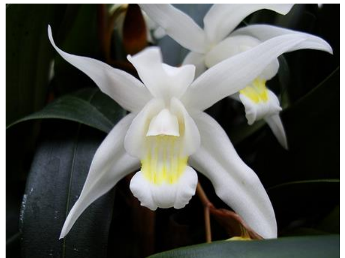
Coelogyne cristata 'Lemoniana'