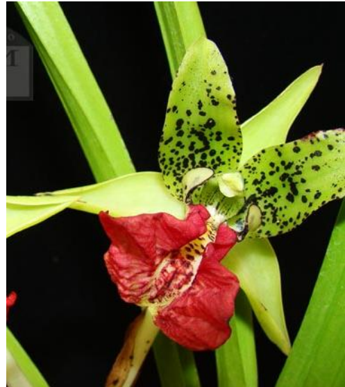
This is Cymbidiella paradina