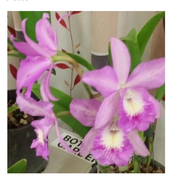
There was a nice plant of Blc Little Mermaid at our February meeting.

There will be a comprehensive growing guide for this type of orchid included in the April newsletter.