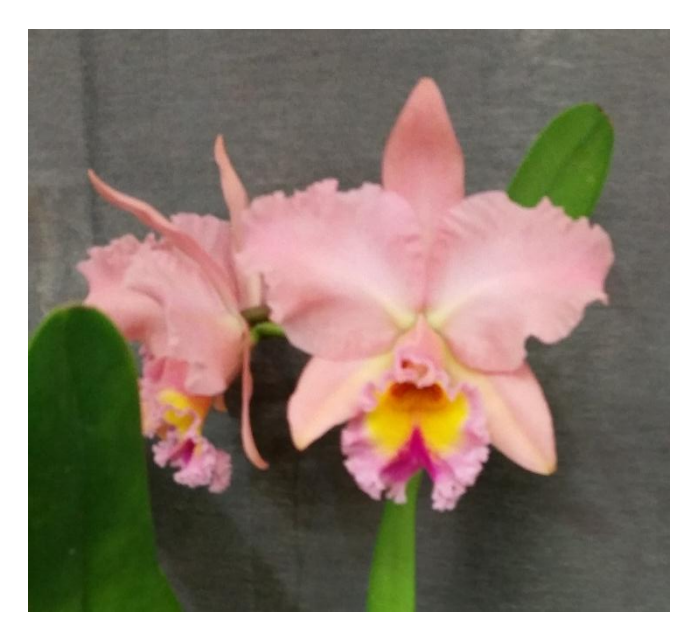
This lovely Laeliinae orchid was shown at our 2017 April Show.

Thanks Brian, your friendship, your orchid knowledge and your contributions will be greatly missed.