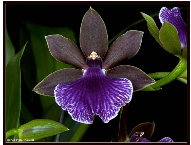
An example of a modern Zygopetalum hybrid. Z. James Strauss x mannum

After successfully growing a Zygo as part of the Growing Competition, many of us are now ready to grow a variety of other Zygopetalum types. Ed has much experience with this orchid group and will provide insights into how to grow these plants in Coffs Harbour. Ed will illustrate his talk with a variety of photographs.