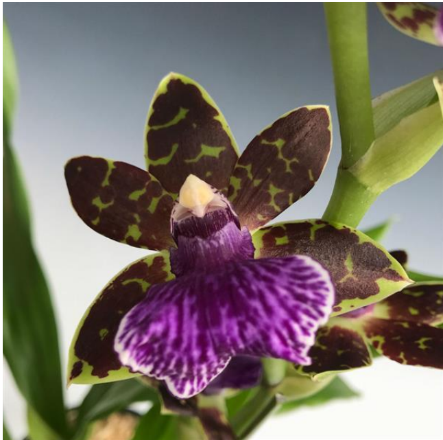
Zygopetalum Advance Australia