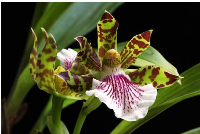
Species orchid Zygopetalum maculatum

Propagation. You can expand your collection by dividing larger plants or by striking back bulbs, either in normal potting mix or in a sealed plastic bag containing a little moist Sphagnum moss. However, single back bulbs are more difficult to strike than those of cymbidiums and as with Lycastes , success is more likely using a clump of 2-3 backbulbs.