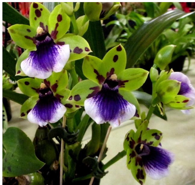
One of the "green" zygos, Zygotetulum Zest.