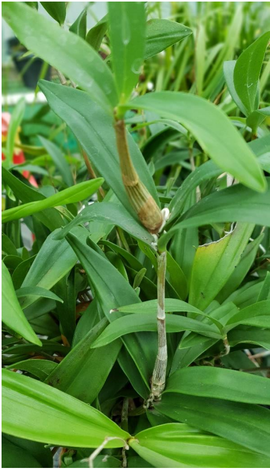
This is a keiki growing on a keiki on my Dendrobium kingianum .