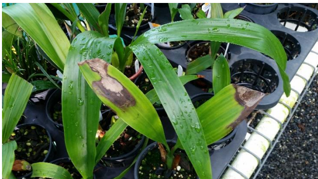
What would you do about this?

If you have a problem plant then you may like to bring it along to the meeting. Leaves with disease or pest problems should be placed in a plastic bag to prevent contamination of healthy plants.