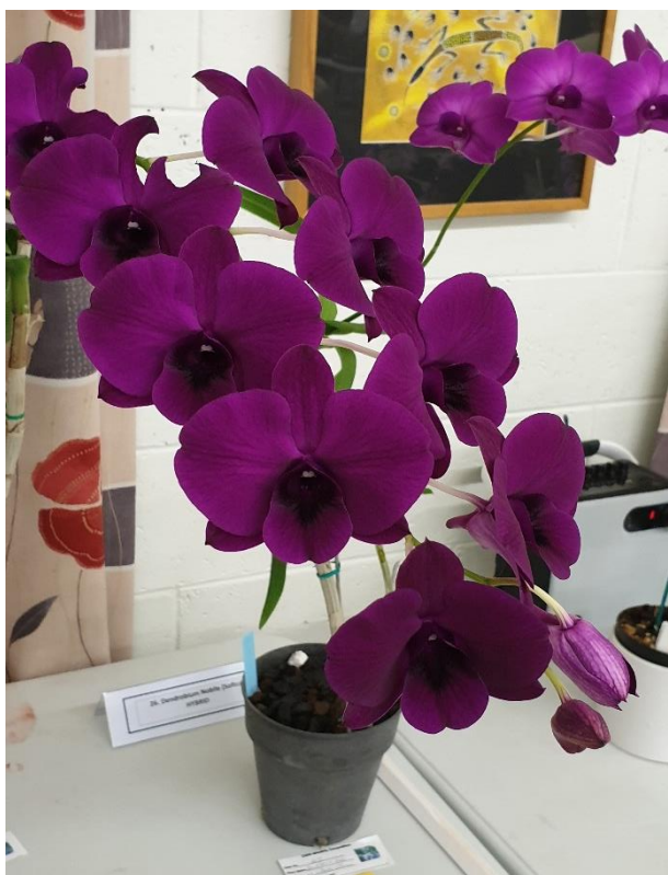
Dick Cooper's beautiful Dendrobium biggibum won popular vote.