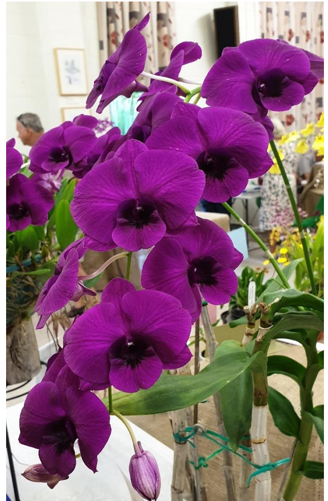
Grand Champion - Dendrobium Dal's Dazzler "BK" R&B Cooper