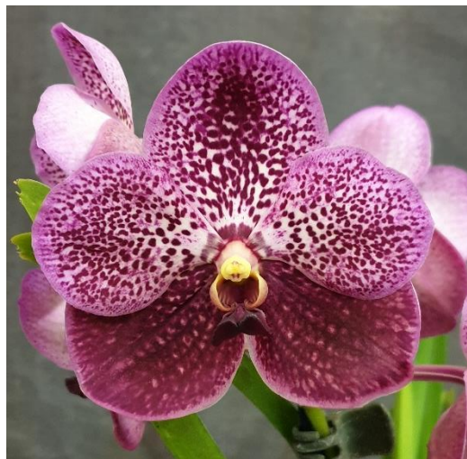
A lovely Vanda at our April show