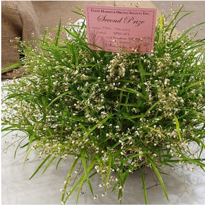
Champion Specimen Gomesa M. Mackay