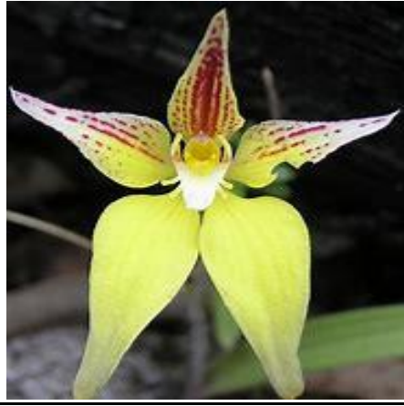
WA Cowslip Orchid. Caladenia flava

The meeting finished at 8.40pm followed by supper.