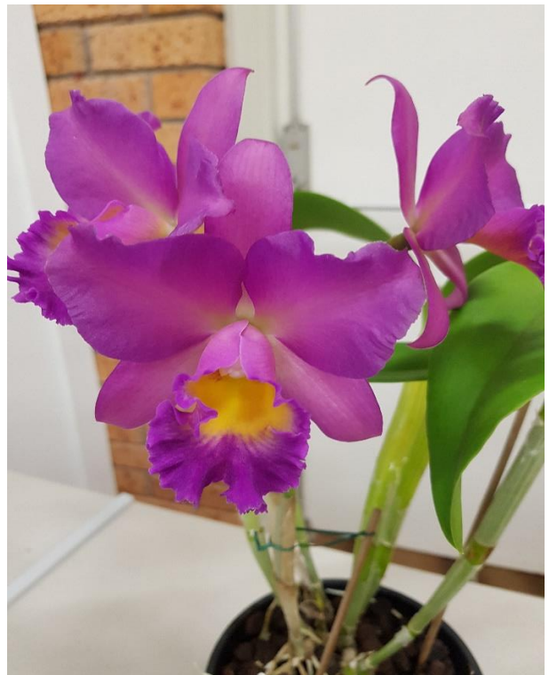
A colourful Cattleya Orchid at NVOS.