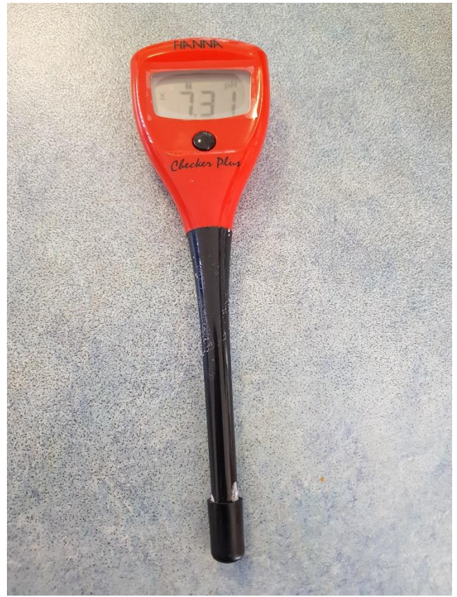
The CHOS Hanna pH Meter