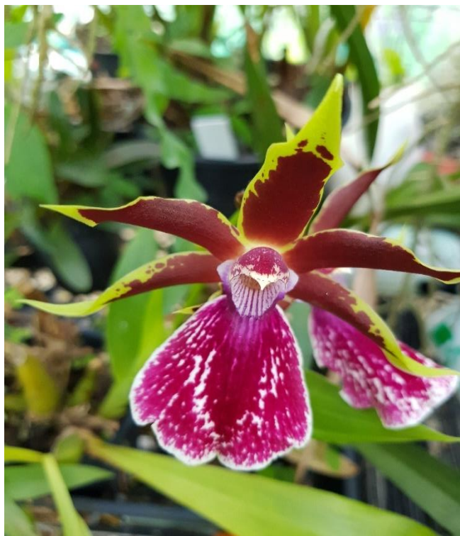
Galeopetalum (Giant x Artur Elle) 'Old Port' now in flower.