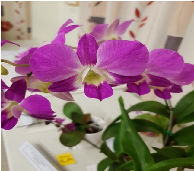
Dendrobium Hugh Fisher on display at the March meeting.