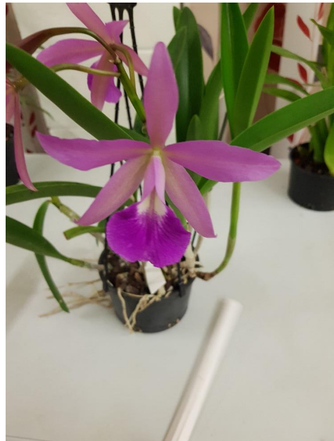
Blc. Gene May x Blc. Maikai at March meeting