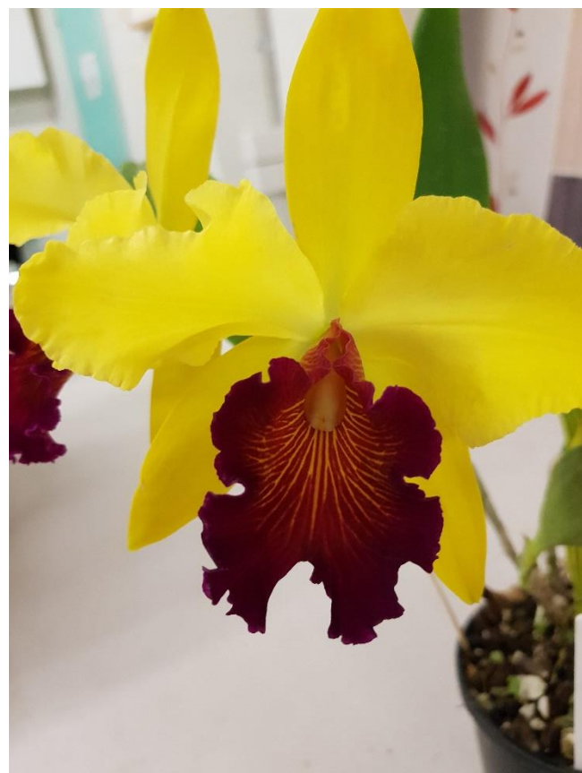
A lovely Cat from the March meeting - Blc. Alma Kee 'Timpalee'