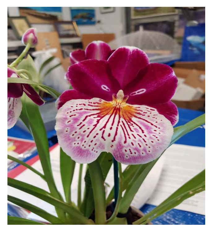
Miltoniopsis Breathless Brilliant (Paige Sinclair)