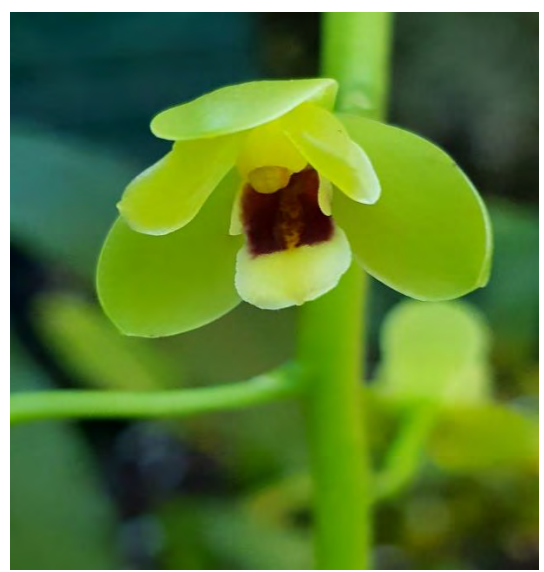
An east coast native Cymbidium - Cym. madidum