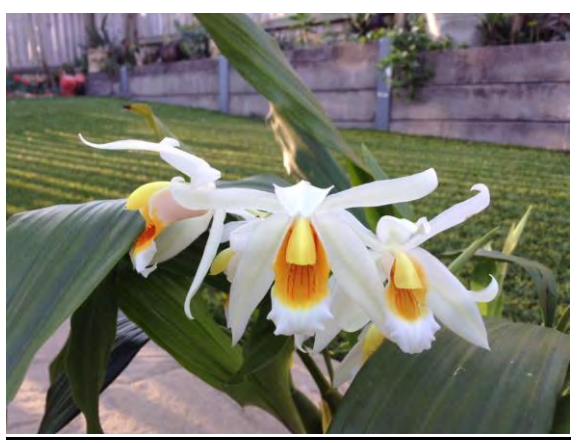
Coelogyne Edward Pearce

2. <u>Fertilizer:</u> Use fertilizer higher in Nitrogen for young plants and then change to fertilizer with a higher amount of Potassium and Phosphorus to encourage flowering. Add a small amount of fertilizer regularly (weekly or fortnightly) especially over the summer period. Some growers add a small amount (1 teaspoon) of slow release fertilizer twice a year to the surface of the pot.