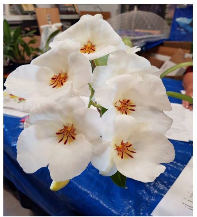
Miltoniopsis Up Country Puna 'Kea 'au Starr'

(j) Paddy's in the bathroom and Murphy shouts to him. "Did you find the shampoo?" Paddy says, "Oi did, but it's for dry hair and I've just wet mine."