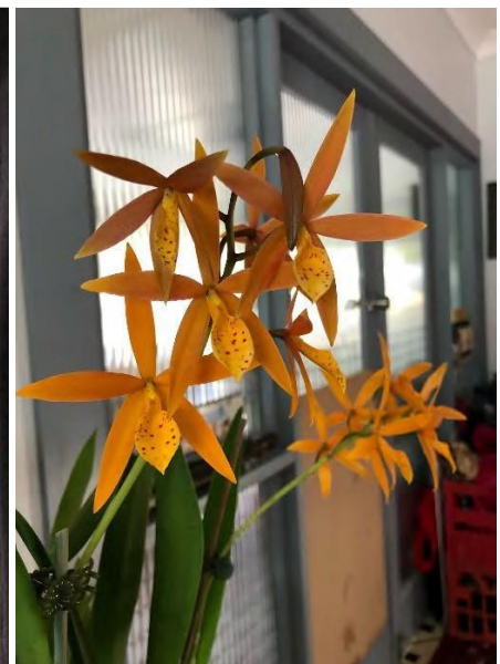
From the Green House of Paige Sinclair: