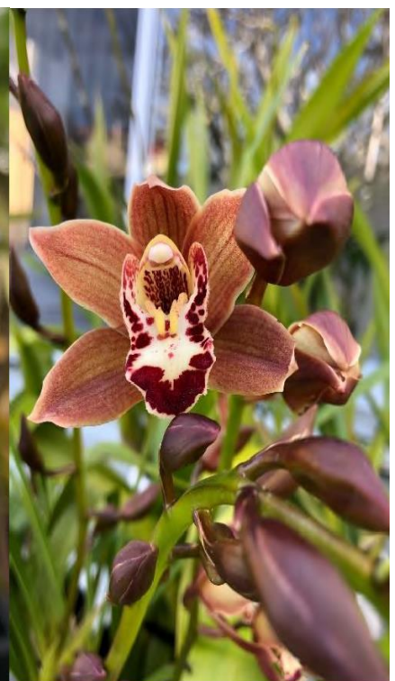
Cymbidium Wyong Flame