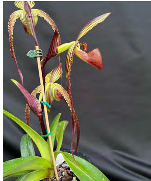
Paph. Prince Edward Of York 'Mary Helen'