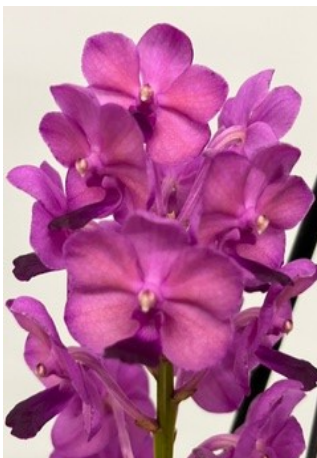
Vascostylis Pine Rivers 'Pink' owned by Pete Gough