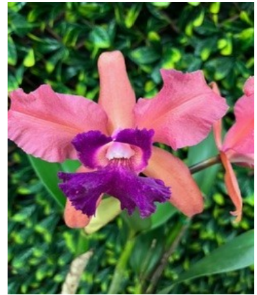
Rhonda Smith benched this amazing Bc. Sunstate Colorchart 'Southern Cross' X C. caudabec