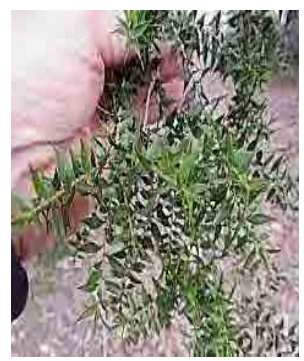
2 young M. quinquenervia trees + leaves