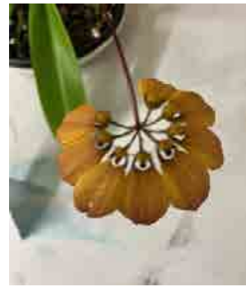
Bulbophyllum mastersianum grown by Sue Flanders